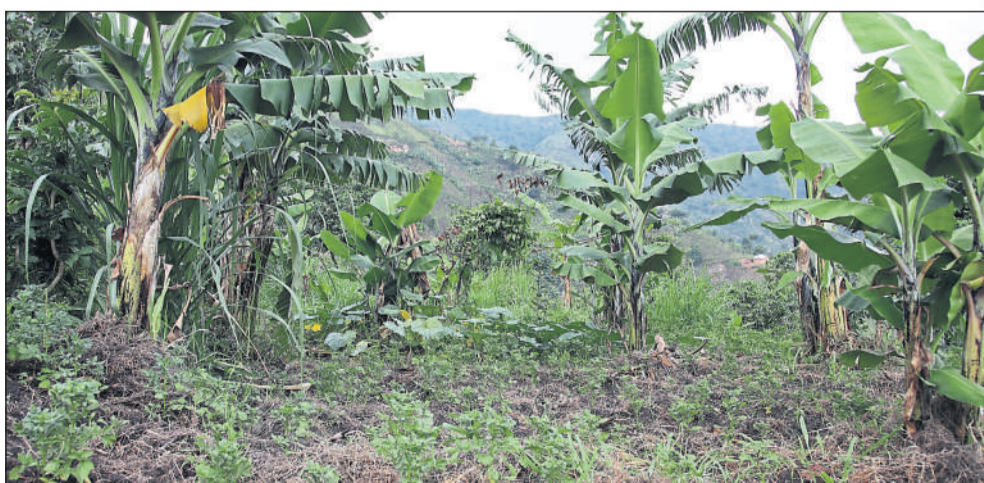
■ Irish potatoes in foreground; plantains growing high; pumpkins in the centre

The eighth edition of the Bradt Guide to Uganda is packed with practical information for travellers with various budgets.