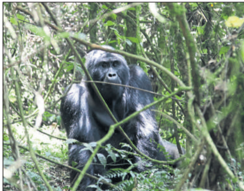
■ Gorilla in Bwindi Impenetrable Forest