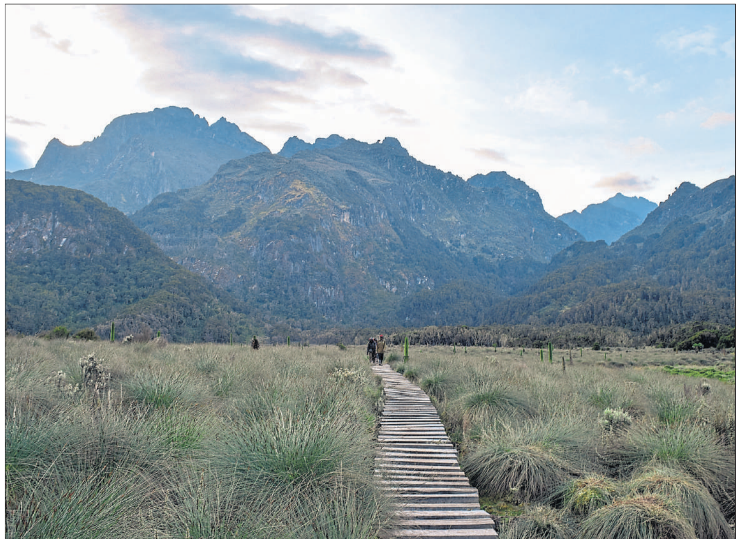
■ Footpaths through bogland in the Rwenzori Mountains National Park, Uganda

The fireplaces in the four cottages that make up Equator Snow Lodge are no affectation: situated at 1,600m, you'll need a jumper at night even though the equator is only 25 miles away. The Lodge is convenient for Rwenzori walks and a blackboard at