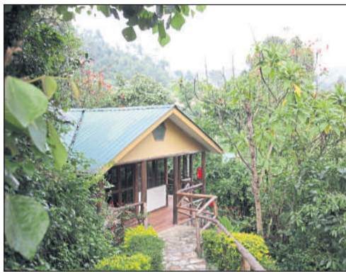
■ Gorilla Safari Lodge