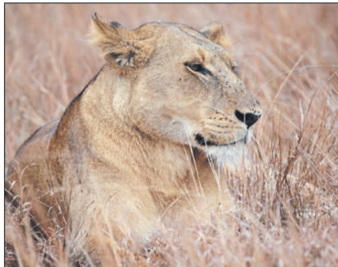
■ Getting up close to a lion

western Uganda is the best place to see gorillas in the wild.