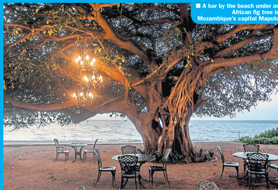
■ A bar by the beach under an African fig tree in Mozambique's capital Maputo