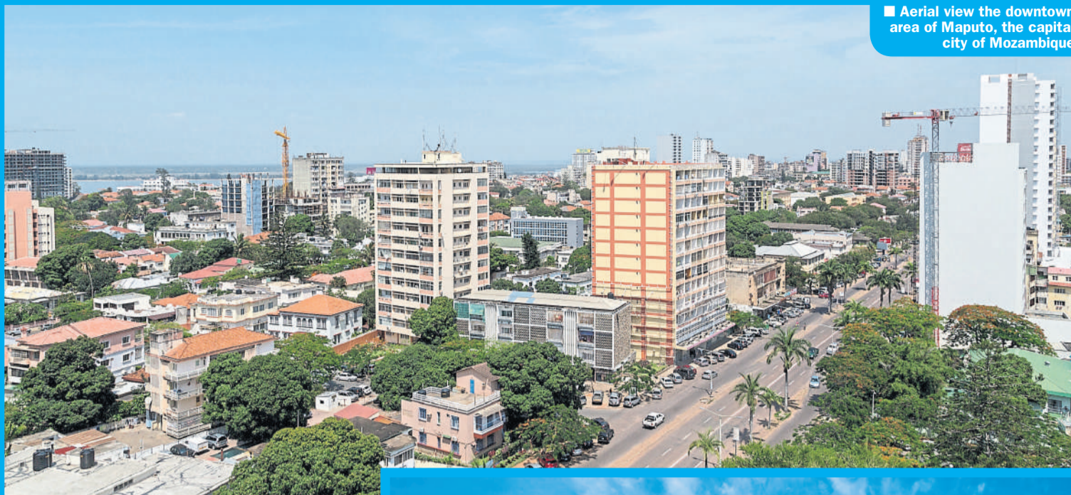
■ Aerial view the downtown area of Maputo, the capital city of Mozambique

trees and the huts where locals try to grow vegetables in a sandy soil. Anvil Bay is owned by a trust and profits are ploughed back into the local community. Solar power provides most of the electricity and a reverse-osmosis well supplies the camp. Here you can have fun on the beach and feel worthy at the same time. If Anvil Bay is too remote for your liking, White Pearl offers straight-up luxury in bungalows, a snazzy pool bar and waiters in the European-style restaurant with little brushes to sweep away breadcrumbs from your table. Turtles come to the beach, horses for riding on the sand and there are boat trips for dolphin watching.