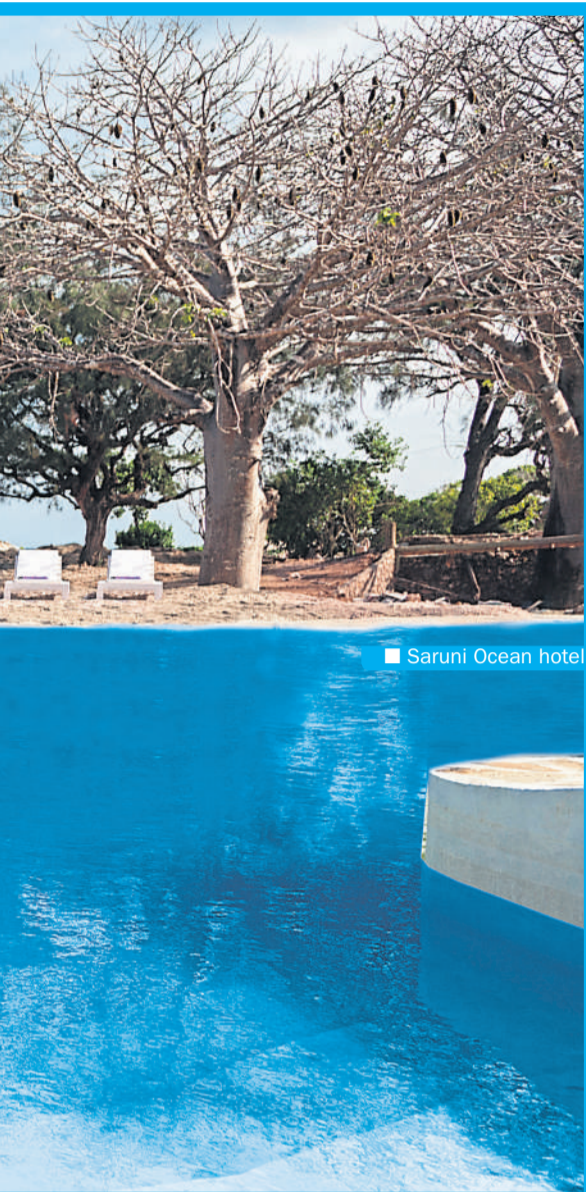
■ Saruni Ocean hotel

cover all meals and drinks and there is a grand beach metres away for water sports, boat rides and camels to be photographed on while taking a ride and looking absolutely daft.