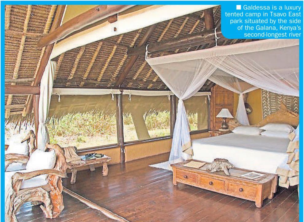
■ Galdessa is a luxury tented camp in Tsavo East park situated by the side of the Galana, Kenya's second-longest river

As well as game drives there are guided walks, bush breakfasts and sundowners on a rockface overlooking the river.