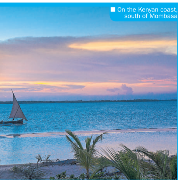
■ On the Kenyan coast, south of Mombasa

cover all meals and drinks and there is a grand beach metres away for water sports, boat rides and camels to be photographed on while taking a ride and looking absolutely daft.