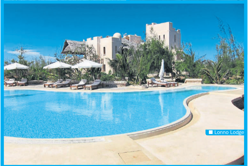
■ Lonno Lodge