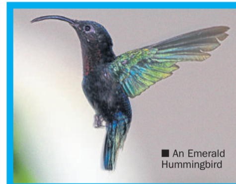
■ An Emerald Hummingbird