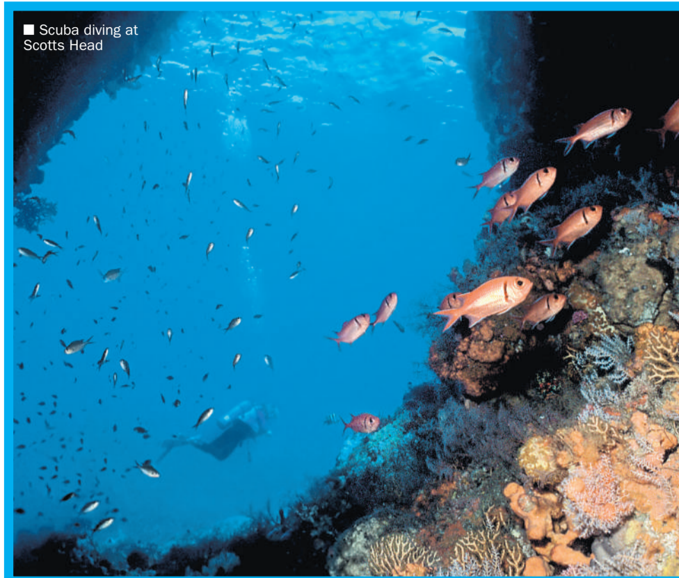
■ Scuba diving at Scotts Head

coast belongs to the Kalinago and their cultural village is worth visiting, if only to see the cassava bakery and taste the bread. On the walking trails it is not difficult to spot hummingbirds hovering and flying backwards in mid-air. Calabishie, on the northeast coast of Dominica close to the airport, is a visitor-friendly village that offers all you need for an idyllic break from routine life. The uncrowded beaches are sandy, with views of the French Antilles on the horizon, the village itself strung out along the road with banana and coconut trees swaying moodily in the background. There are plenty of self-catering apartments and pretty bungalows for