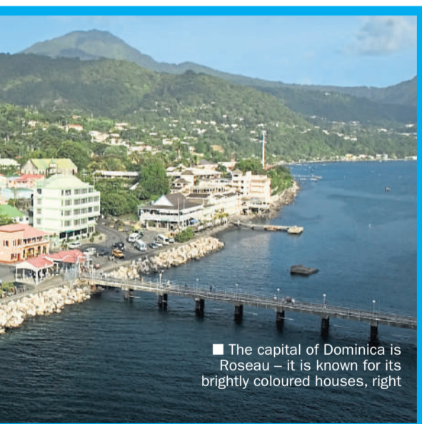
■ The capital of Dominica is Roseau – it is known for its brightly coloured houses, right

rent by the day (calibishie-lodges.com, windblowestate.com, bayviewlodges.com, dominicaseaviewapartments.com, dominica-cottages.com), shops, restaurants, buses. Elma Napier and her husband dropped out of high society life in London and came to live just south of Calabishie in 1932 with their young children. Her Black and White Sands (papillotepress.co.uk) is a great in-situ read and her home at Pointe Baptiste can be rented (pointebaptiste.com); in the grounds, her grandson makes chocolate for sale (try the lemongrass variety). Point Babtiste has a terrific beach and the suitably named Escape Bar and Grill is tucked away here.